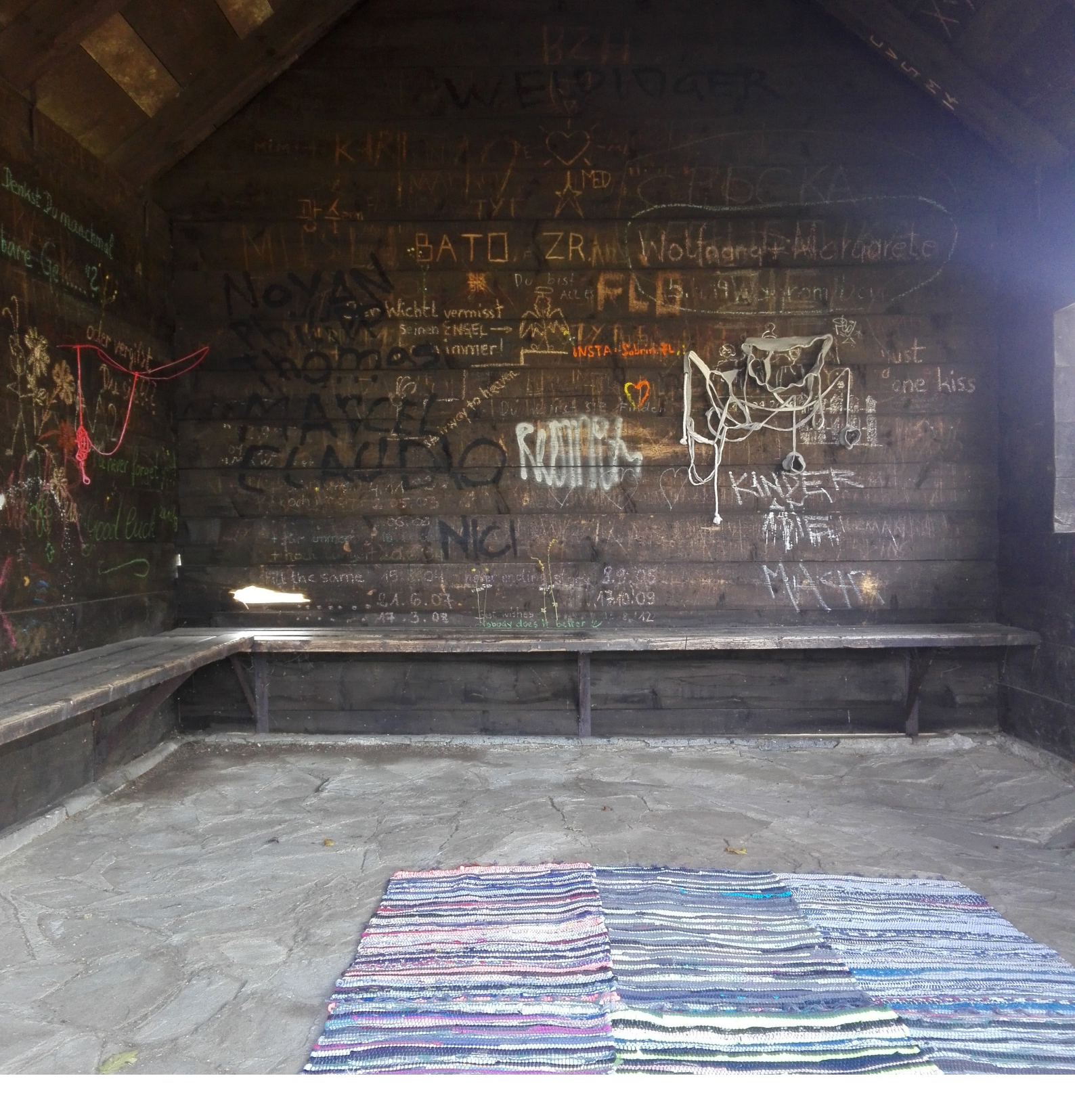
'A Walk in the Park' - installation view