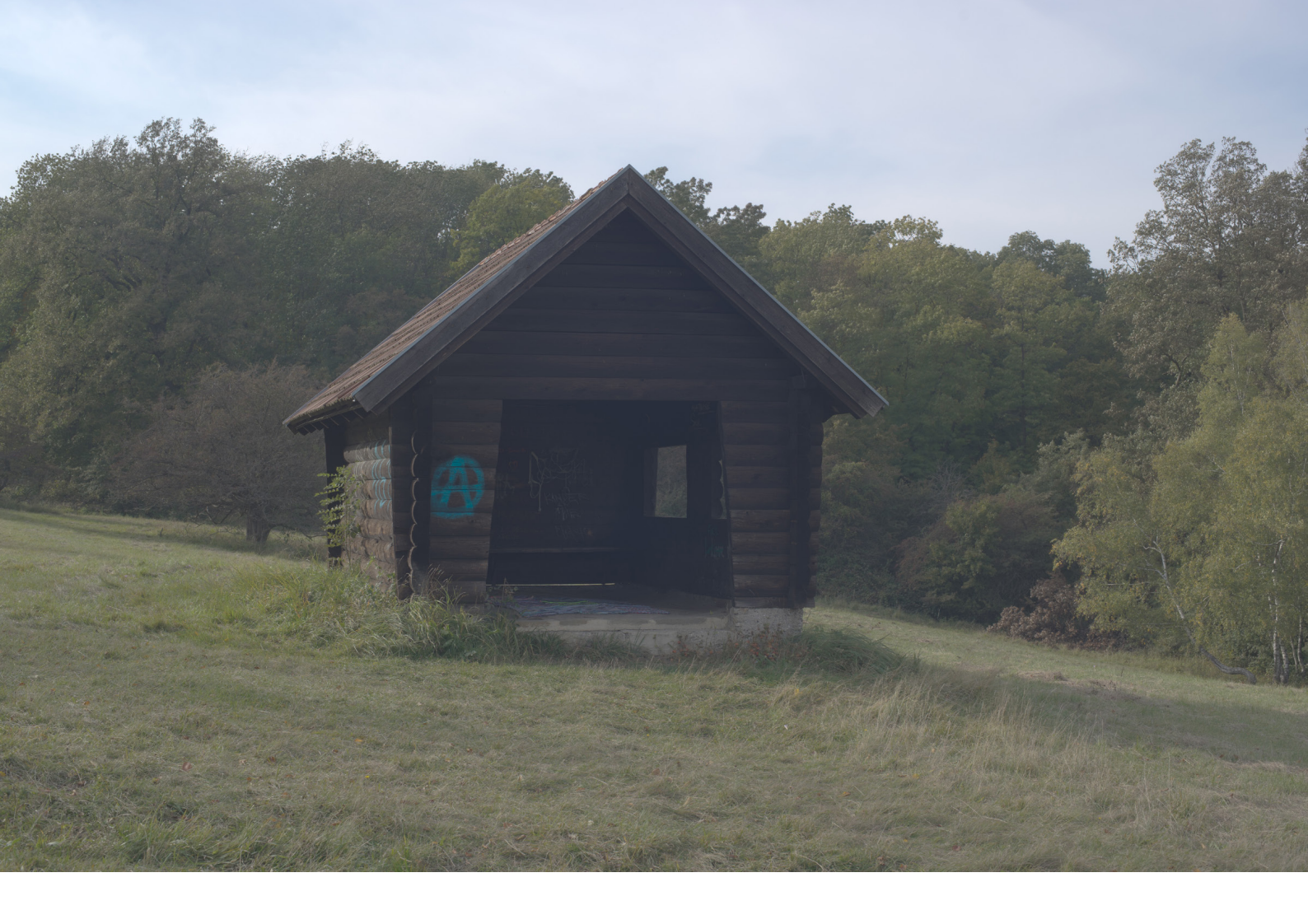
'A Walk in the Park' - outside view