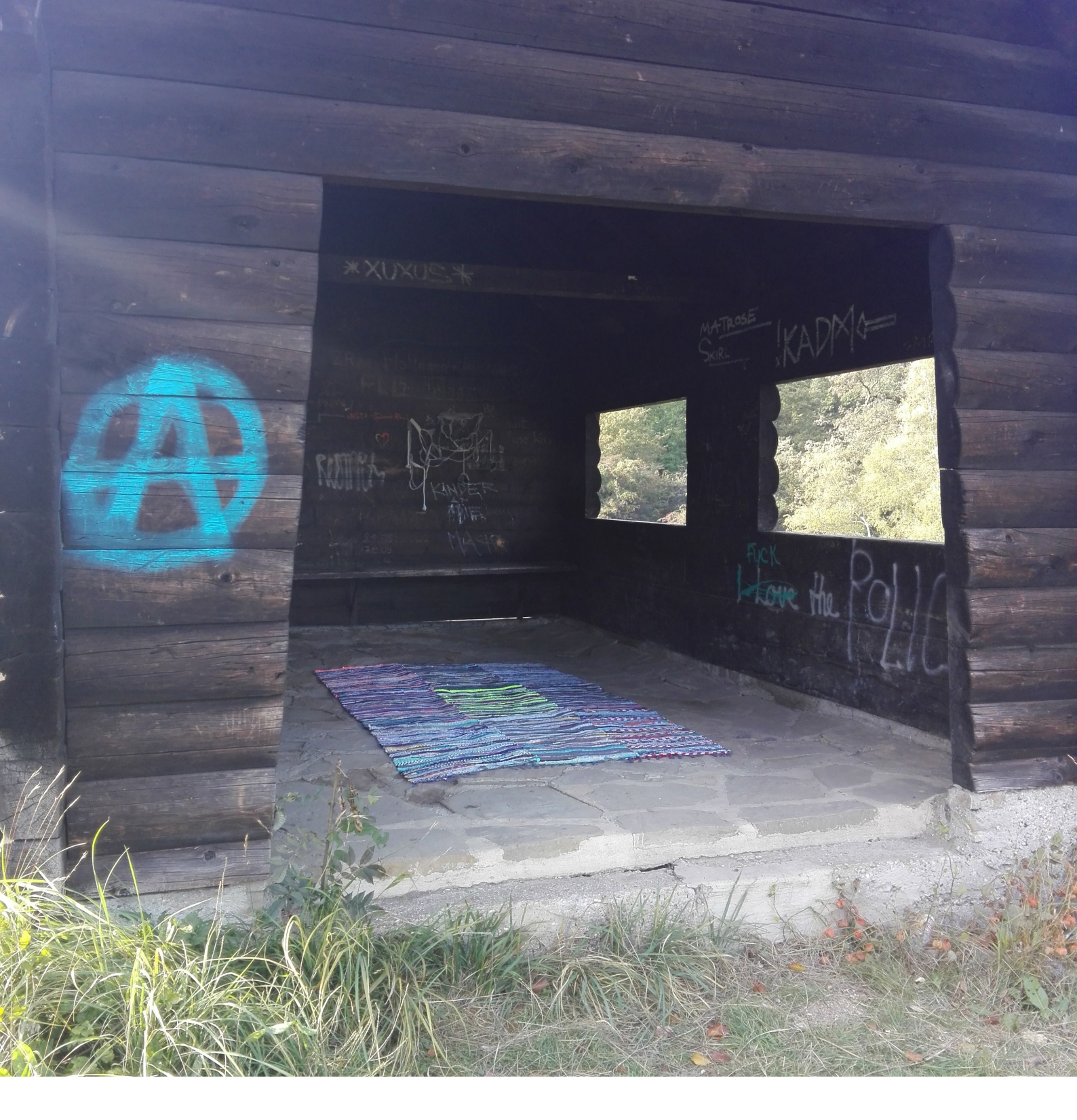
'A Walk in the Park' - installation view