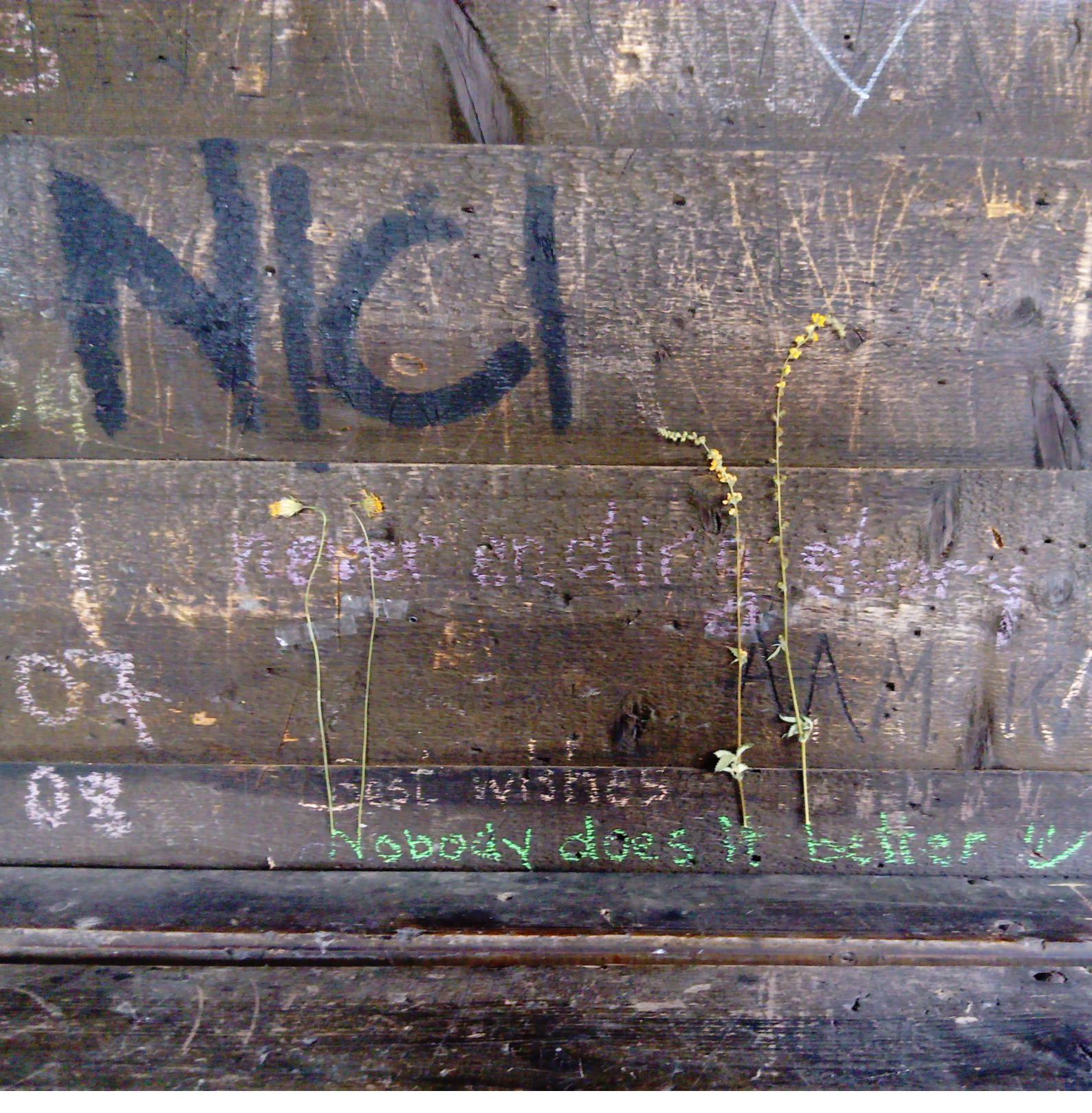
Anna Holtz: 'Blumen' (detail), 2020 dried flowers, variable dimensions