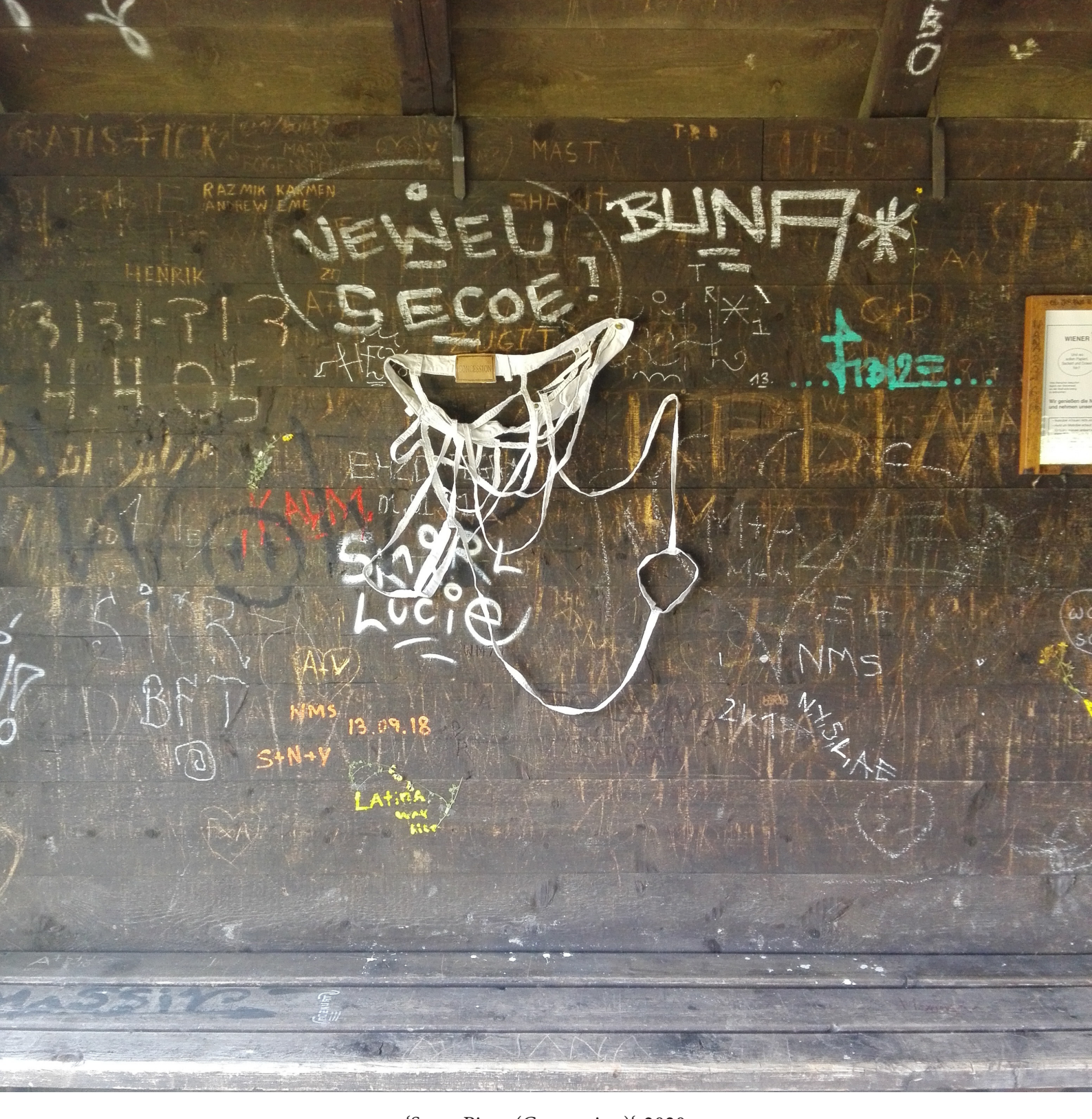
'Seam Piece (Concession)', 2020 textile, variable dimensions