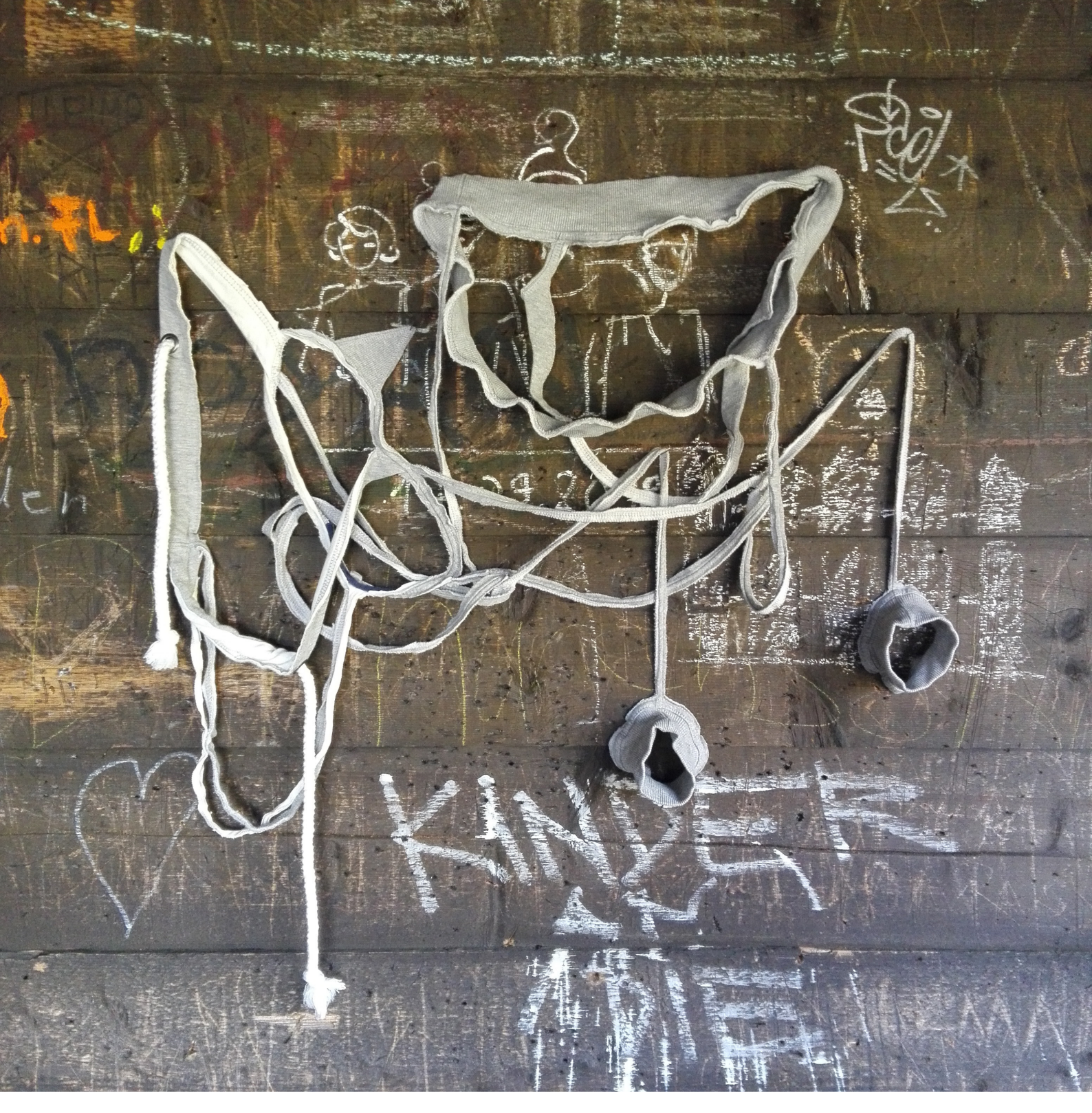
'Seam Piece (Wild One)', 2020 textile, variable dimensions