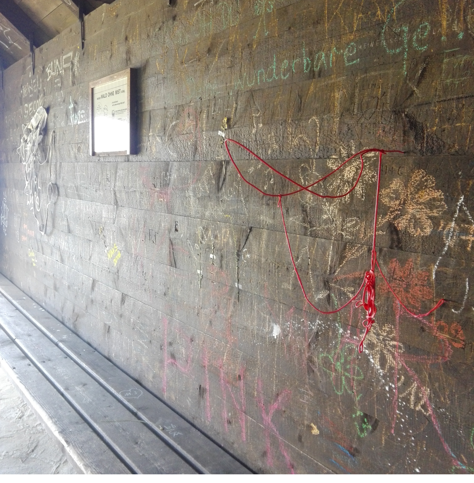
Anna Holtz: 'El Prosecco', 2020 wire, plastic, string, latex, 43,5x23x45 cm