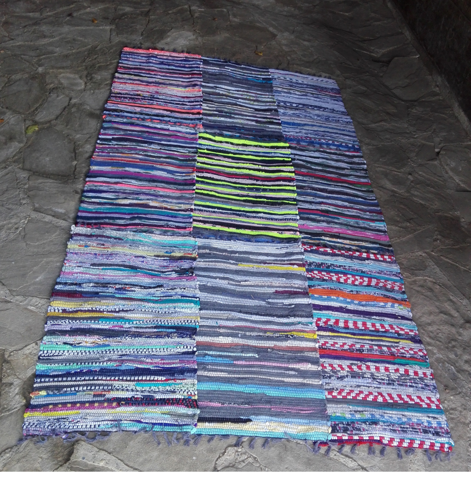
'Untitled (Possibilities)', 2020 rag rugs, variable dimensions