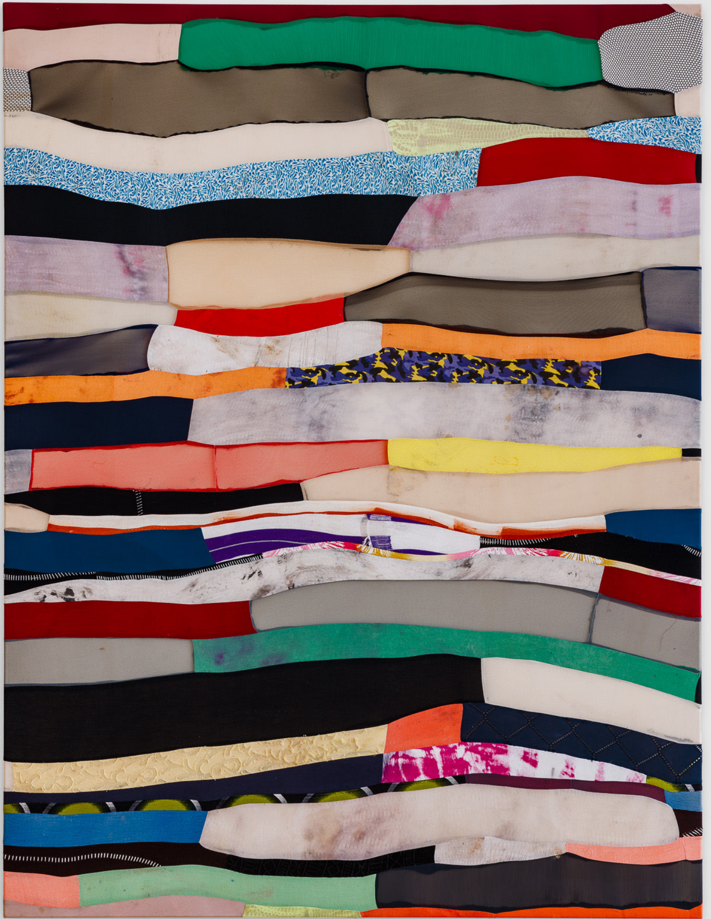
Rag Rug Picture (Inventory) , 2018 Rag rug fabrics, thread, cotton canvas 170x140 cm