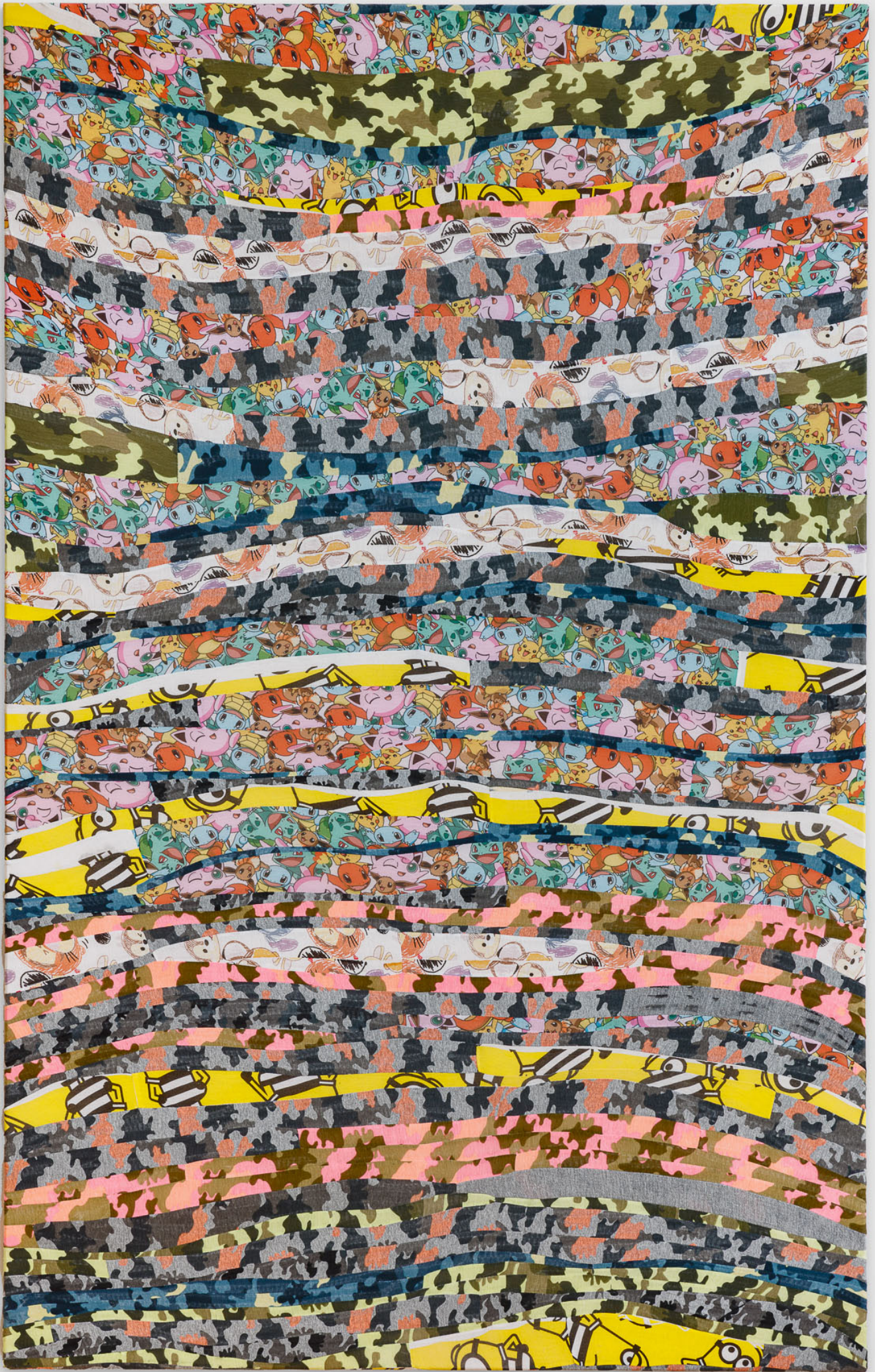
Rag Rug Picture (Untitled) , 2019 Rag rug fabrics, thread, cotton canvas 190x120 cm