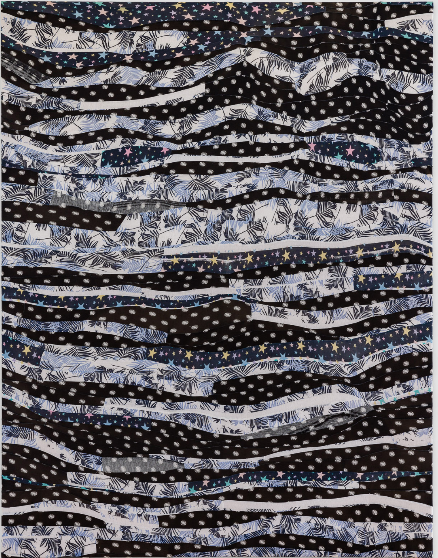
Rag Rug Picture (Cafe Zynismus oder Wein&Co), 2019 Rag rug fabrics, thread, cotton canvas 180x150 cm