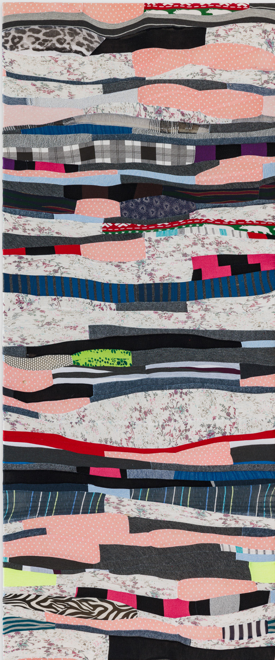
Rag Rug Picture (Oikonomia) , 2017 Rag rug fabrics, thread, cotton canvas 180x75 cm