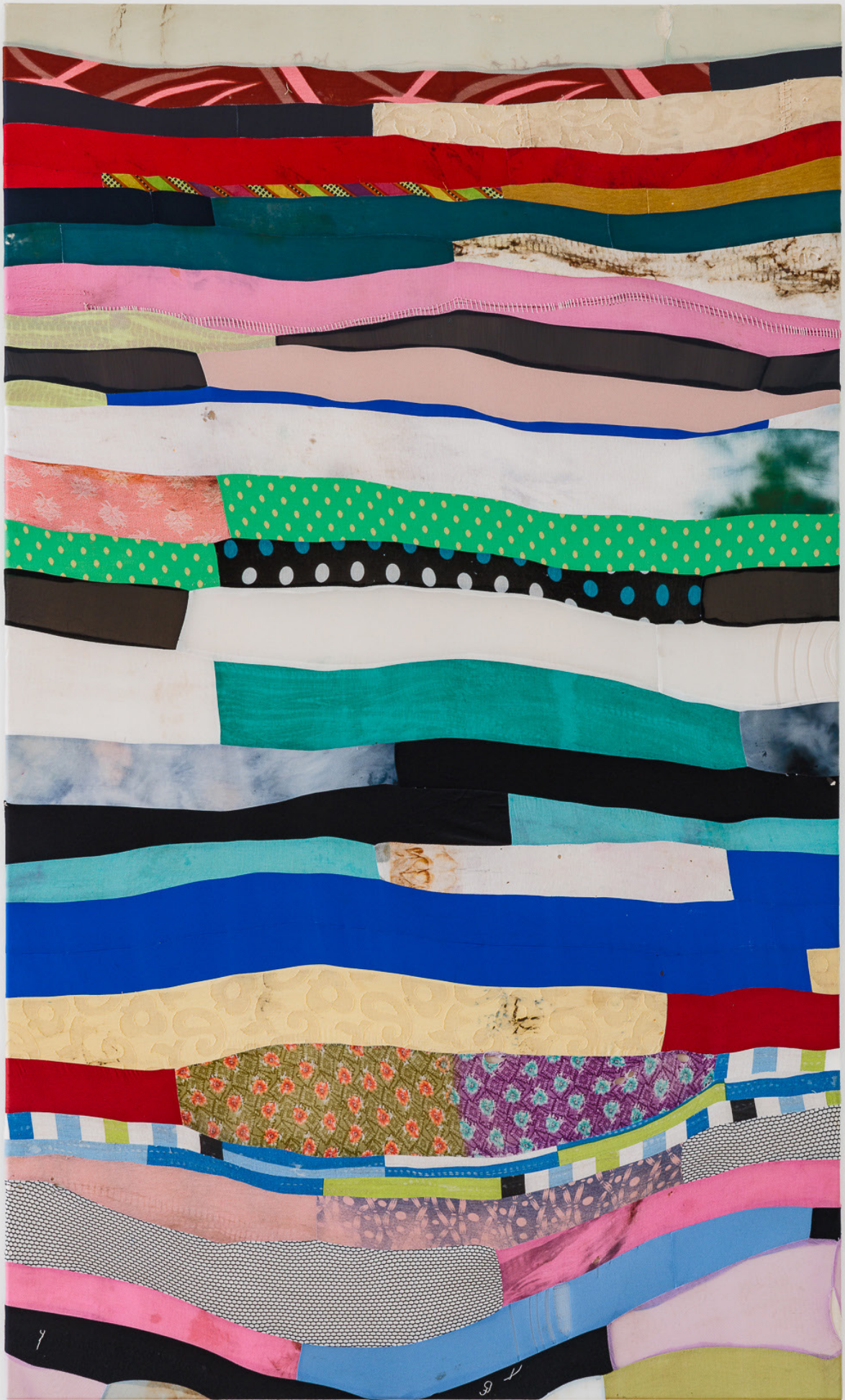
Rag Rug Picture (Oddly Specific) , 2018 Rag rug fabrics, thread, cotton canvas 150x90 cm