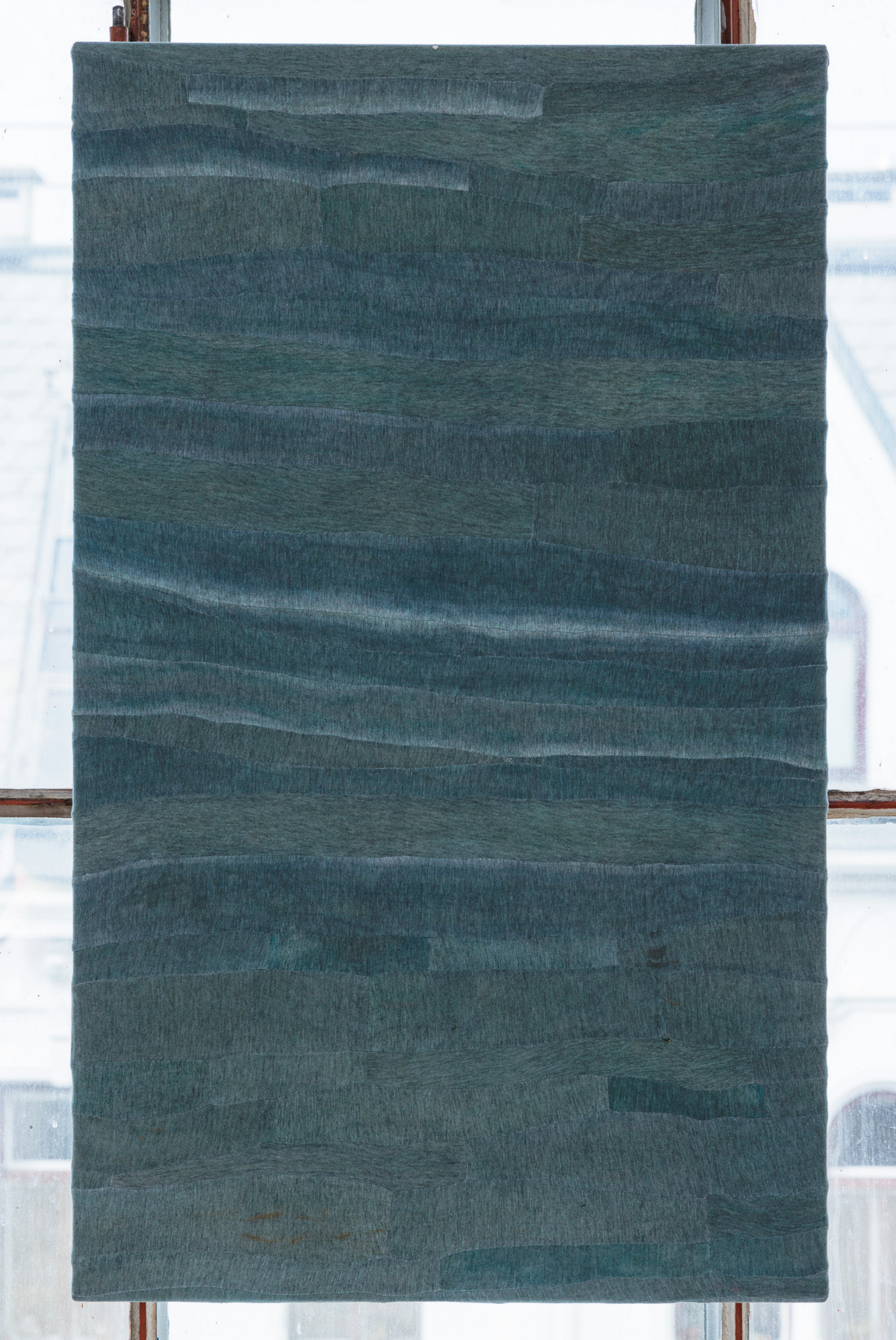
Rag Rug Picture (Painting Idea) , 2017 Rag rug fabrics, thread, cotton canvas 100x60 cm