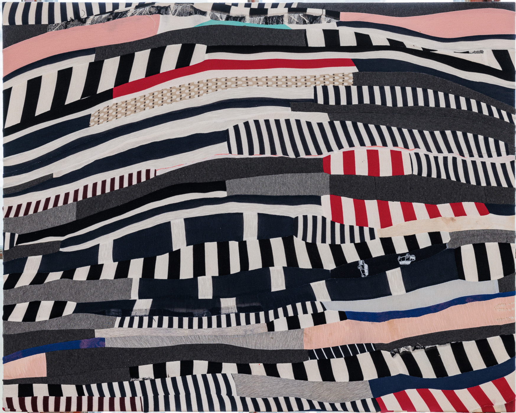
Rag Rug Picture (Reference Hell-O) , 2017 Rag rug fabrics, thread, cotton canvas 80x100 cm