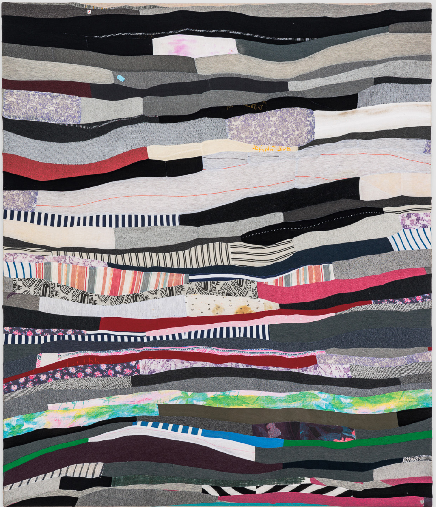
Rag Rug Picture (Yok Yok) , 2017 Rag rug fabrics, thread, cotton canvas 135x115 cm