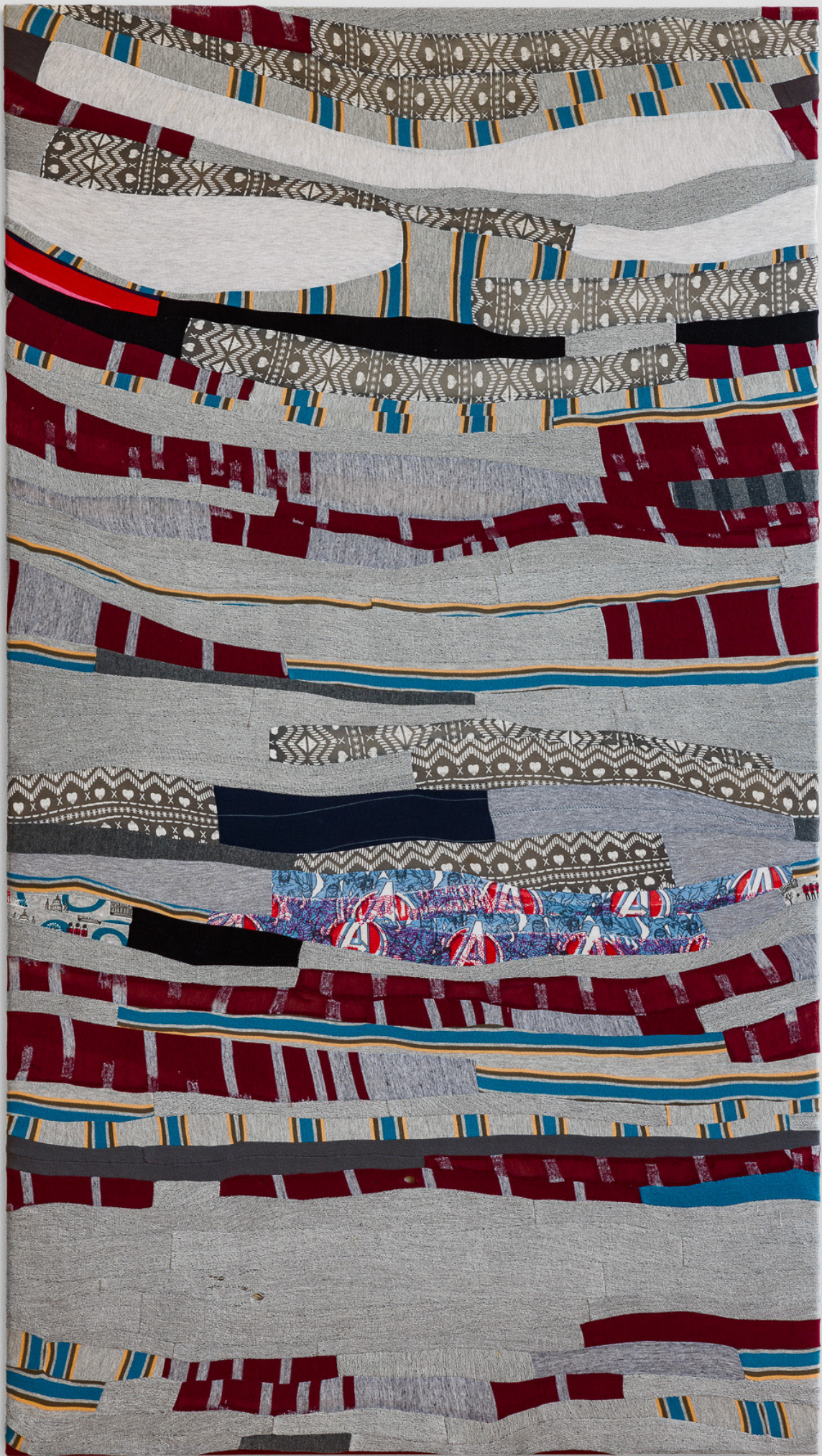
Rag Rug Picture (Sold to the Highest Buddha) , 2017 Rag rug fabrics, thread, cotton canvas 160x90 cm