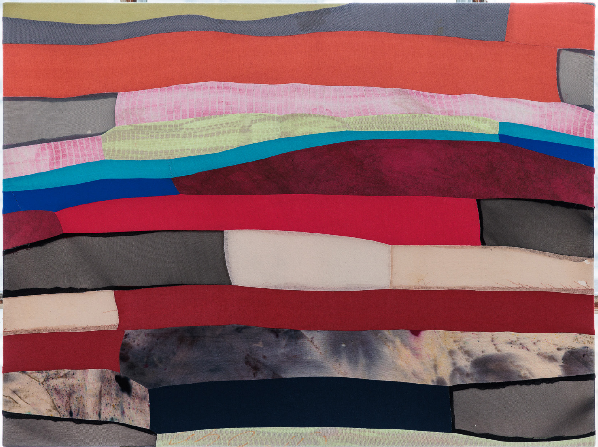
Rag Rug Picture (Le Ray au Soley) , 2018 Rag rug fabrics, thread, cotton canvas 60x80 cm