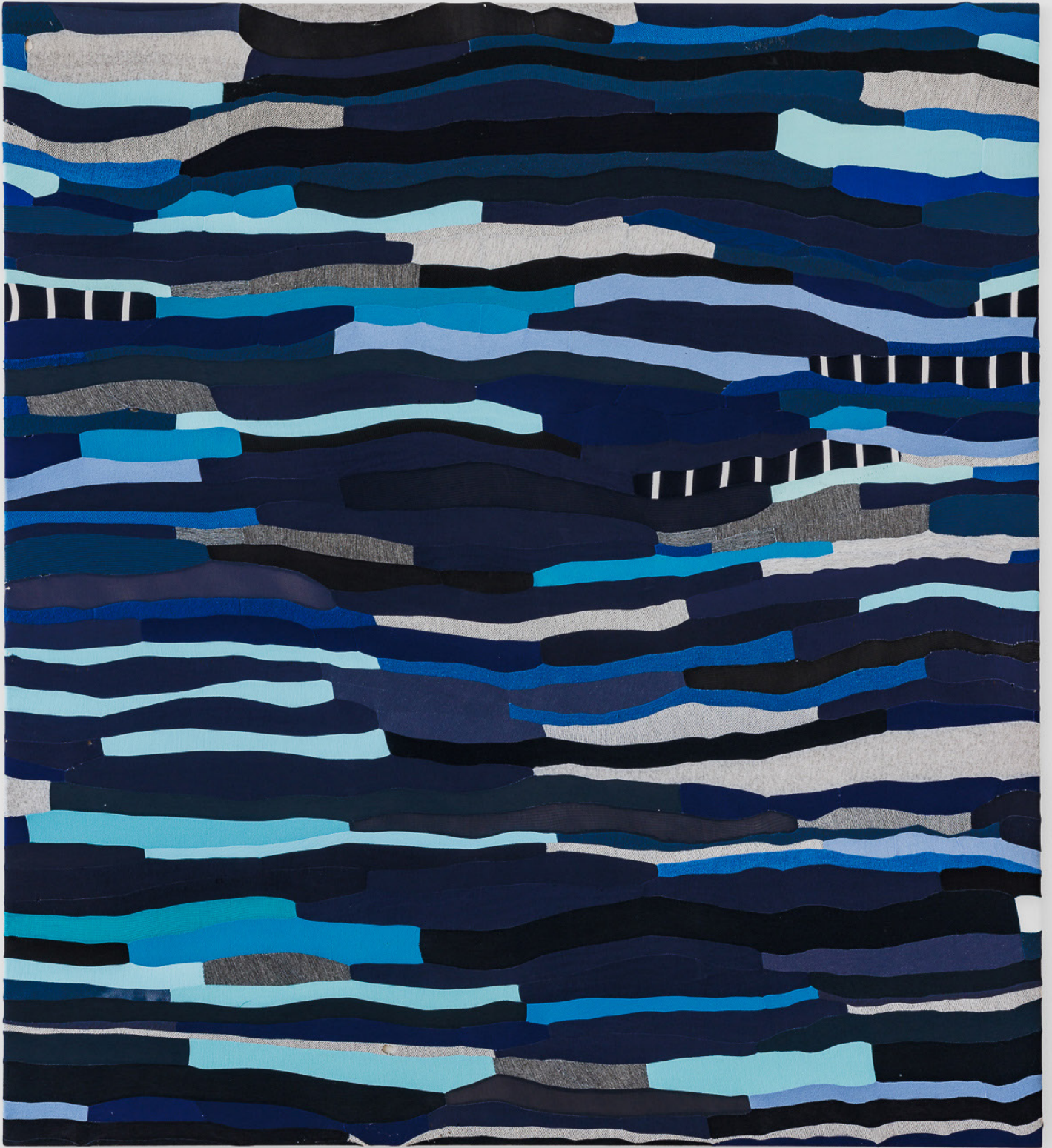
Rag Rug Picture (Borrowed Title) , 2019 Rag rug fabrics, thread, cotton canvas 160x145 cm