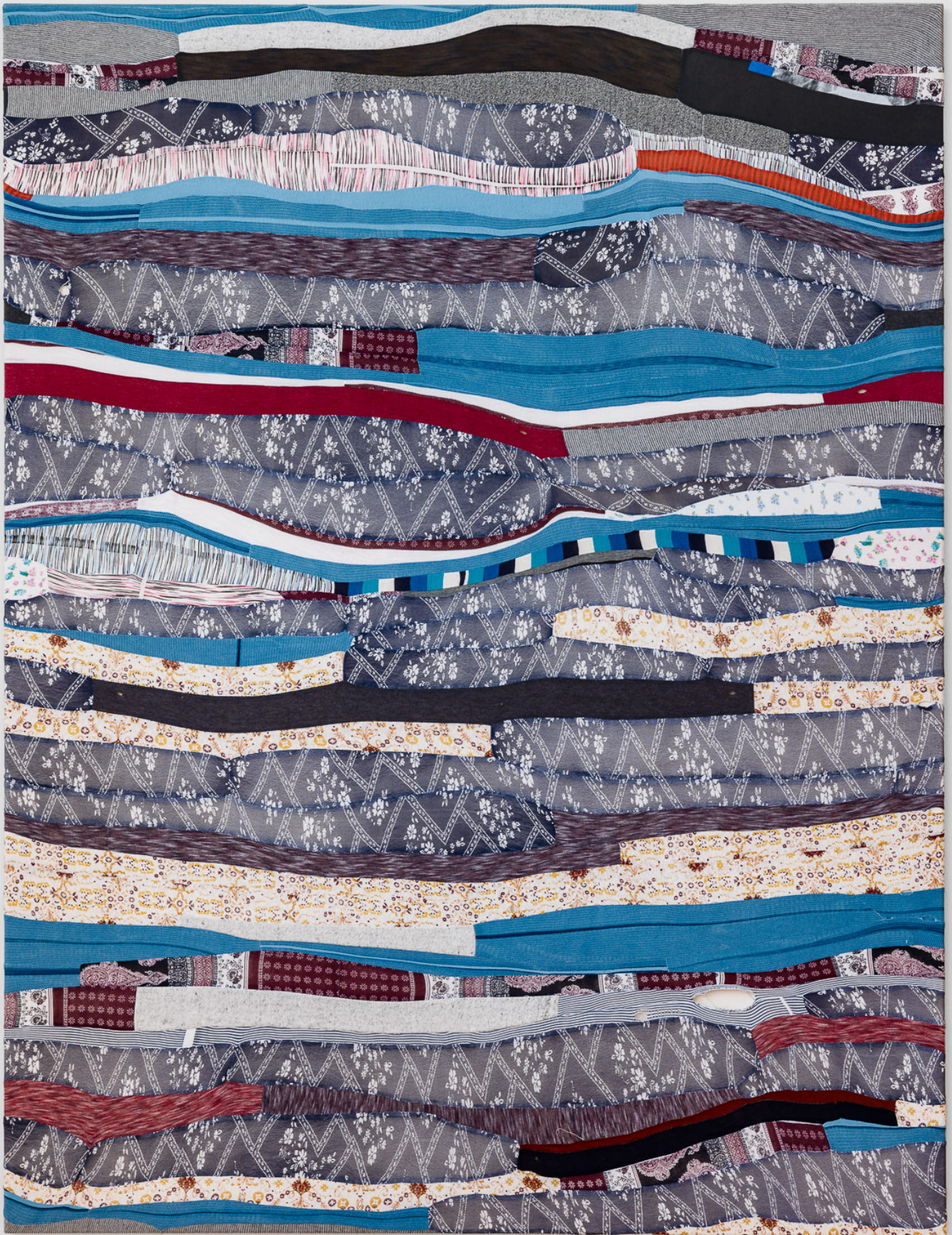
Rag Rug Picture (Alkohol oder Psychopharmaka) , 2018 Rag rug fabrics, thread, cotton canvas 170x140 cm