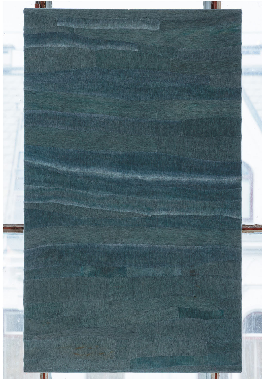
Rag Rug Picture (Painting Idea) , 2017 Rag rug fabrics, thread, cotton canvas 100×60 cm