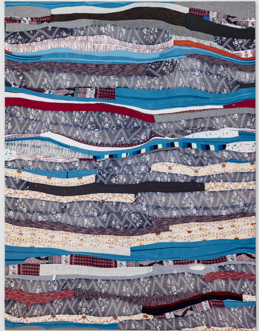
Rag Rug Picture (Alkohol oder Psychopharmaka), 2018 Rag rug fabrics, thread, cotton canvas 170×140 cm