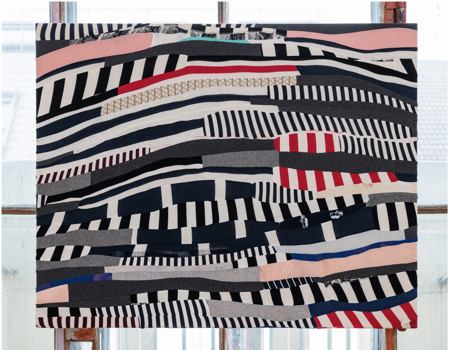
Rag Rug Picture (Reference Hell-O), 2017 Rag rug fabrics, thread, cotton canvas 80×100 cm