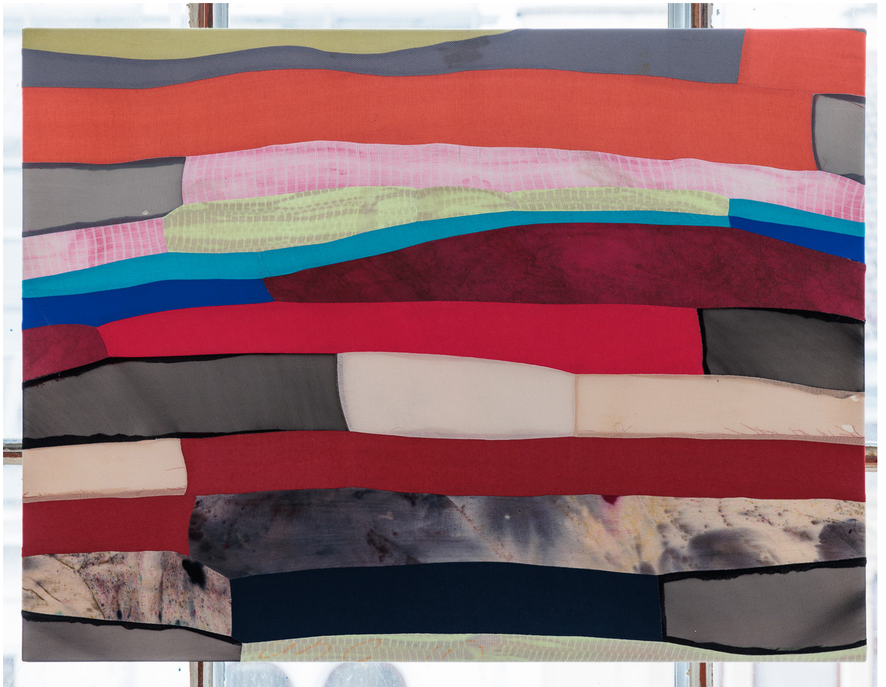
Rag Rug Picture (Le Ray au Soley) , 2018 Rag rug fabrics, thread, cotton canvas 60×80 cm